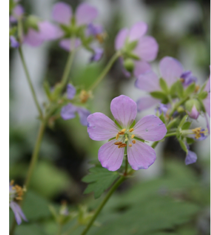
Dozens of perennials for both shade and sun are well-adapted to thrive in drought conditions, including (left) sun-loving purple prairie clover (Dalea purpurea) and (right) wild geranium (Geranium maculatum), which prefers a shadier setting.

*Liatris(s), Gayfeather Limonium latifolium, sea lavender Linum perenne , blue flax Nepeta(s), catmint *Oenothera(s), primrose Origanum(s), ornamental oregano *Parthenium integrifolium, wild quinine *Penstemon(s) Perovskia 'Little Spire, Russian sage *Pulsatilla(s), pasque flower *Ratibida(s), Mexican hat Salvia(s) Saponaria ocymoides, soapwort *Scutellaria resinosa, prairie skullcap Sedum(s)