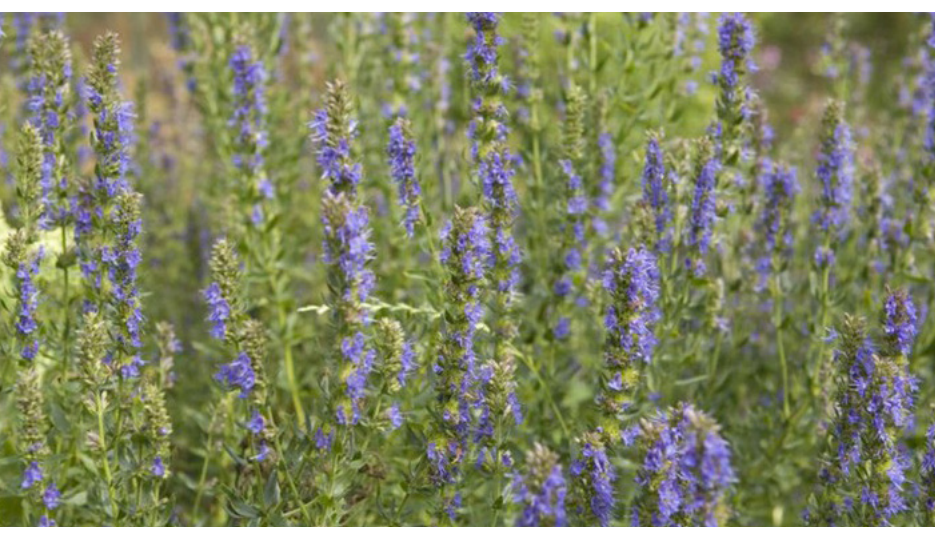
Common hyssop (Hyssopus officinalis)

Campanula rotundifolia (12" h, 12" w) This dainty beauty blooms with clusters of blue, bell-shaped flowers on the tips