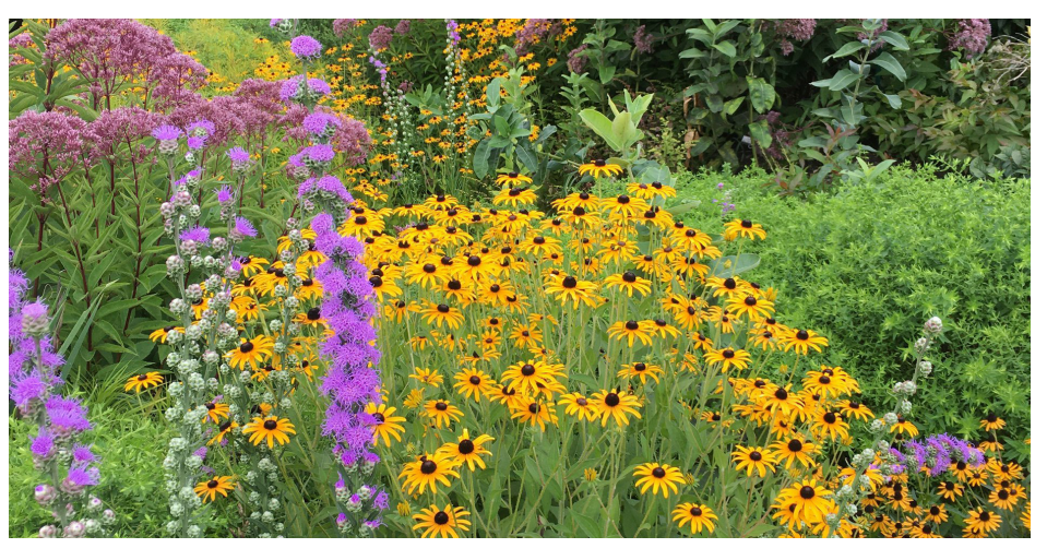
Colors directly across from one another on the color wheel—like purple and yellow— tend to complement each other, as seen here with blazing star meadow gayfeather ( Liatris lingulistylis ) in the foreground, showy black-eyed Susan ( Rudbeckia fulgida var. speciosa ) in the middle and 'Gateway' Joe Pye plant ( Eupatorium maculatum ) in the upper left.

Physical support is another advantage to grouping different plants. Prairies are the ultimate mixed landscape, with the dense basal growth of grasses propping up tall but weak-stemmed vertical plants like pitcher sage, sunflowers and asters. Many tall ornamental plants have "bare legs"—lower stems with a minimum of foliage. For them, both the physical and visible support of plants with lower, bushier foliage helps them look their best.