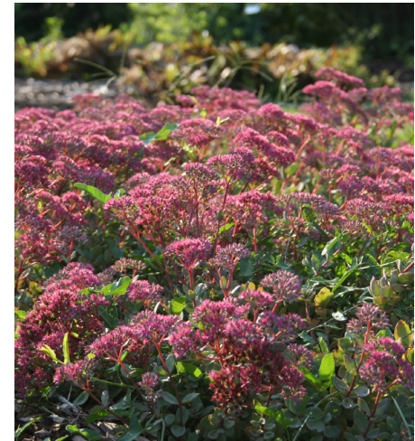
Autum joy sedum