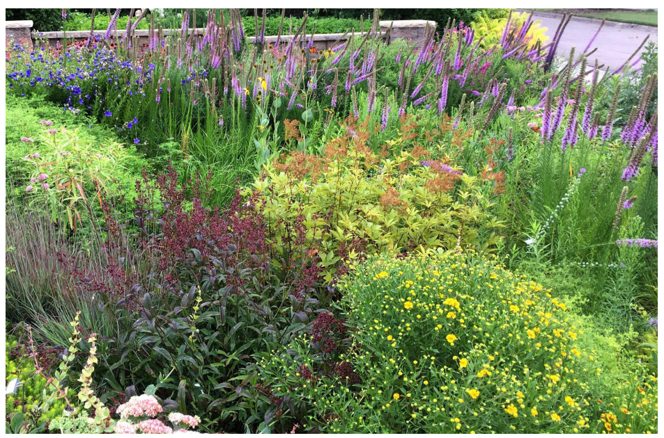
Back row: 'Eureka' thickspike gayfeather (Liatris pycnostachya 'Eureka'); middle: queen of the prairie (Filipendula rubra); front left: Penstemon 'Dark Towers'; front right: Helenium 'Rotgold'

Stachys(s), lamb's ear and betony Tanacetum niveum , snowy tansy Thermopsis villosa, Carolina lupine *Tradescantia(s), spiderwort