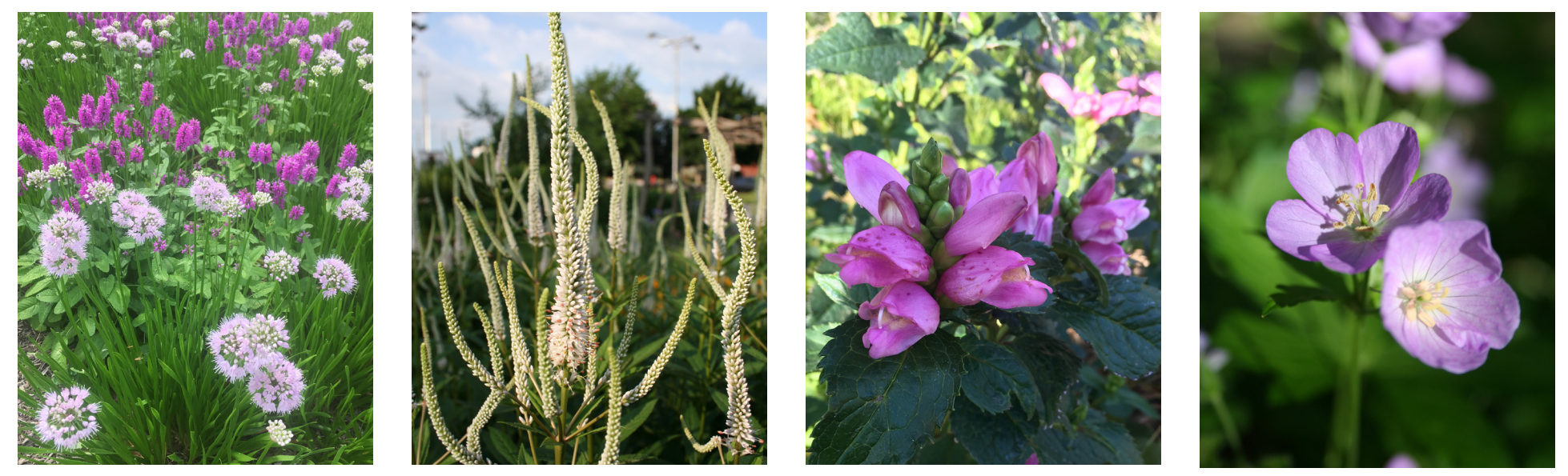
Left to right: 'Summer Beauty' ornamental onion ( Allium lusitanicum 'summer beauty' ) and 'Hummelo' betony ( Stachys monieri 'Hummelo' ), Culver's root ( Veronicastrum virginicum 'Albo-Rosea' ), 'Hot Lips' pink turtlehead ( Chelone lyonii 'Hot Lips' ) and wild geranium ( Geranium maculatum )

We might be familiar with tried-and-true popular perennials like black-eyed Susan, coneflower and coreopsis, but there are hundreds of other lesser-known plants that will add plenty of pop to your garden. The following list of hidden gems are proven performers and highly recommended for Nebraska landscapes. They may not be the most popular perennials, but they are guaranteed to bring beauty and uniqueness to your garden.