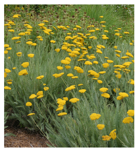
Yarrow (Achillea millefolium)

In our 40+ years of helping people establish landscapes across Nebraska, we have planted in tough sites and tricky situations and with all levels of maintenance and expertise. The success of many of these projects has depended on having a foundation of plants that will shine (or at least grow), regardless of what happens around them. A few species have risen to the top of our list as tried and true. These are our go-to plants—the ones we recommend regardless of a gardener's experience. They aren't always the trendy species, and they're definitely not the new and exciting, but they make a great base for new gardeners or for sites that make even experienced gardeners scratch their heads.