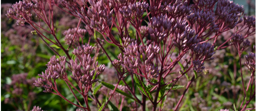
Joe Pye plant ( Eupatorium maculatum ) can grow to 72 inches, so it's a good choice for the back of a border, paired with shorter perennials in the front of your bed.

To extend your garden's bloom time, consider adding asters, hyssop (Agastache